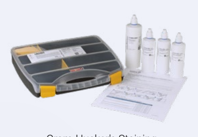
Gram-Hucker's Staining Kit (Droppers) for clinical diagnosis

Azur-Eosin-Methylene Blue solution according to Giemsa (slow) for clinical diagnosis